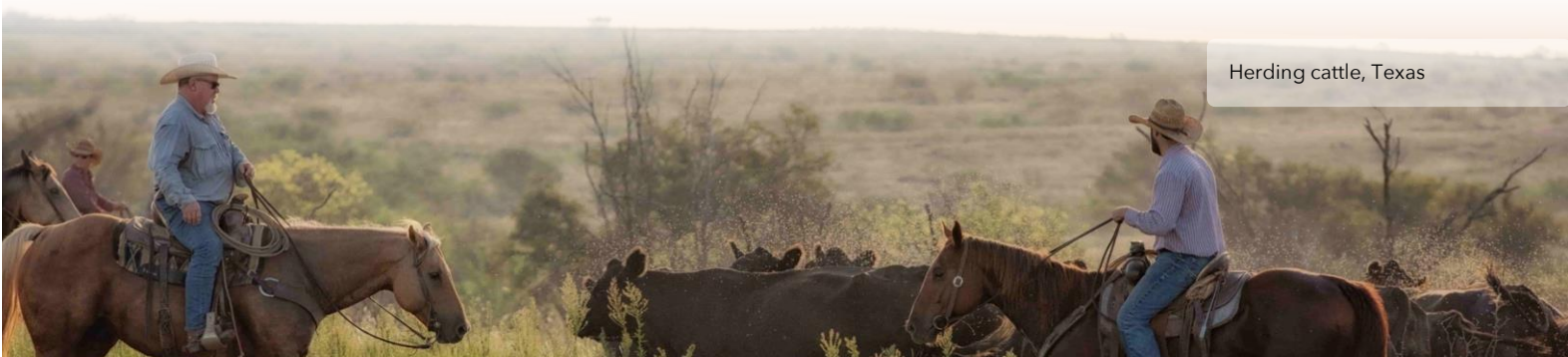
Herding cattle, Texas

The Scorecard Goals will enable us to understand the cumulative impact the Community is having on the biome. Given that implementation and monitoring must happen at the local and regional levels, the Goals are designed to be broad, adaptable, and approachable for each sector. Goals are organized into three categories: Socioeconomic (Goal 1), Ecological (Goals 2-5), and Industry and Private Sector (Goals 6-7). A full description of each can be found in the Appendices.